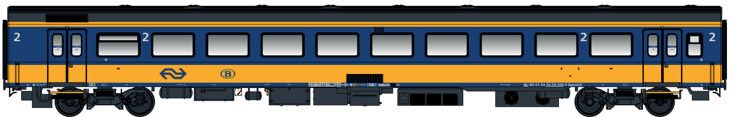
44 240 ICRmh Bpmdz9, blauw/geel, stam 16436 (Benelux) Ep. VI